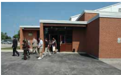
The Inquiry breaks for lunch.