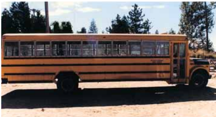
The school bus used during the confrontation on September 6, 1995.