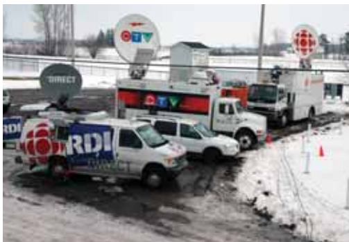
TV satellite trucks in Forest, February, 2006.