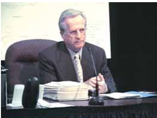
Thomas O'Grady OPP Commissioner in September 1995