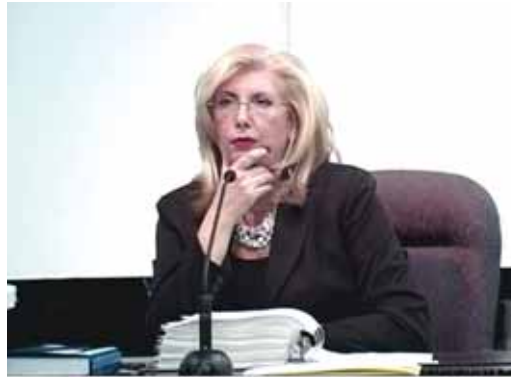
Elaine Todres Deputy Solicitor General in September 1995