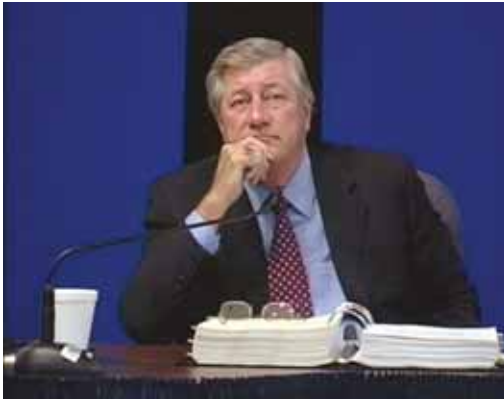
Michael Harris Premier of Ontario in September 1995