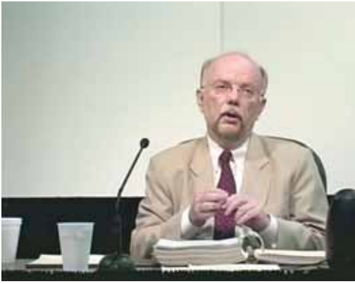
Larry Taman Deputy Attorney General & Deputy Minister of Native Affairs in September 1995