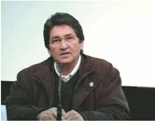
Ovide Mercredi National Chief, Assembly of First Nations in September 1995