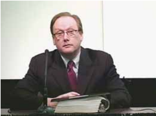
Charles Harnick Attorney General in September 1995