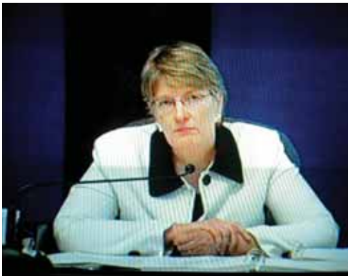
Gwen Boniface OPP Commissioner at the time of testimony, June, 2006