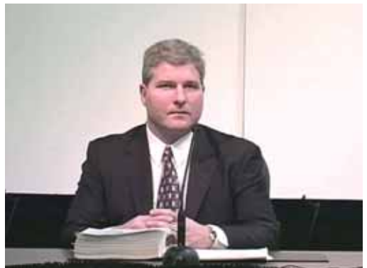
Christopher Hodgson Minister of Natural Resources in September 1995