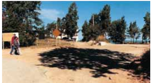
Sandy parking lot, the scene of the confrontation between Aboriginal occupiers and the OPP where Dudley George was shot.